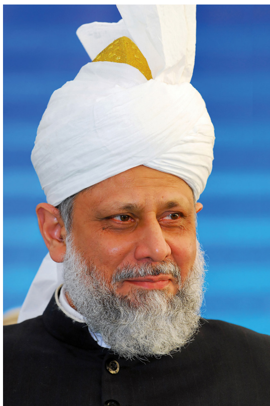
His Holiness Mirza Masroor Ahmad Khalifatul Masih V