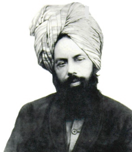
Hadhrat Mirza Ghulam Ahmad (1835-1908) The Promised Messiah and al-Imam al-Mahdi The Founder of the Ahmadiyya Muslim Community