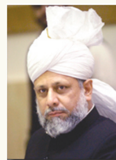
Hadhrat Mirza Masroor Ahmad

Another outstanding achievement of the Community is the Muslim Television Ahmadiyya — MTA, a 24-hour global satellite learning channel.